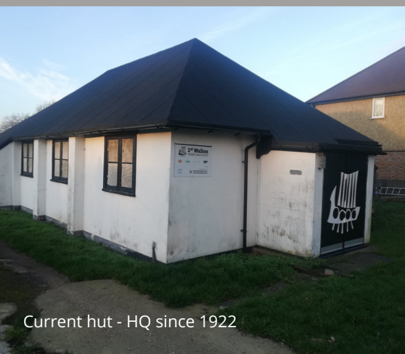
Current hut - HQ since 1922